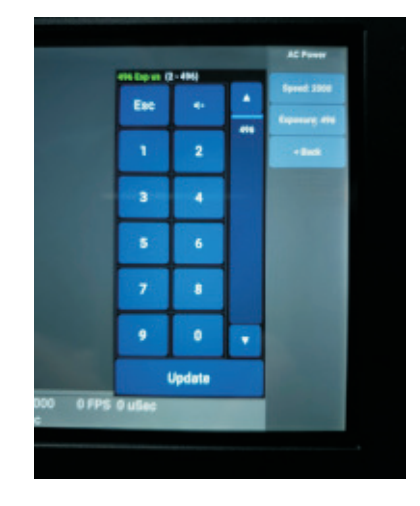
EXPOSURE TIMES SETTINGS MENU