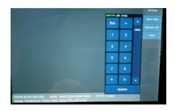
RECORDING SPEED SETTINGS MENU