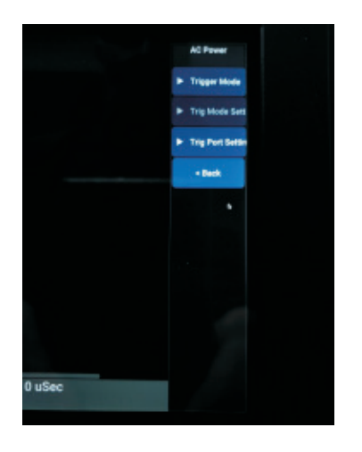
TRIGGER MODE SETTINGS MENU